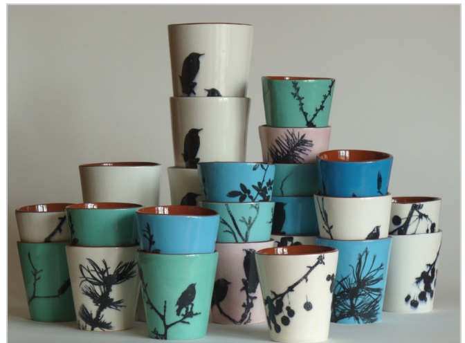
Cups & Vases