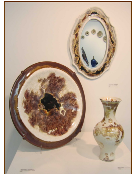
More images from the show on page two