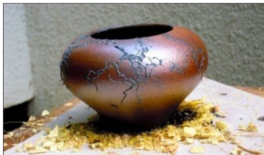
More Raku results