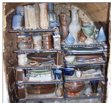
Photos from last year's wood firing at Shadbolt Centre, Burnaby